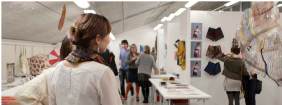
Chelsea College of Art and Design

Inspired by the philosophy of psychogeography, second-year textile students at the Chelsea College of Art and Design recently showcased a body of work that explores the importance of colour within design.